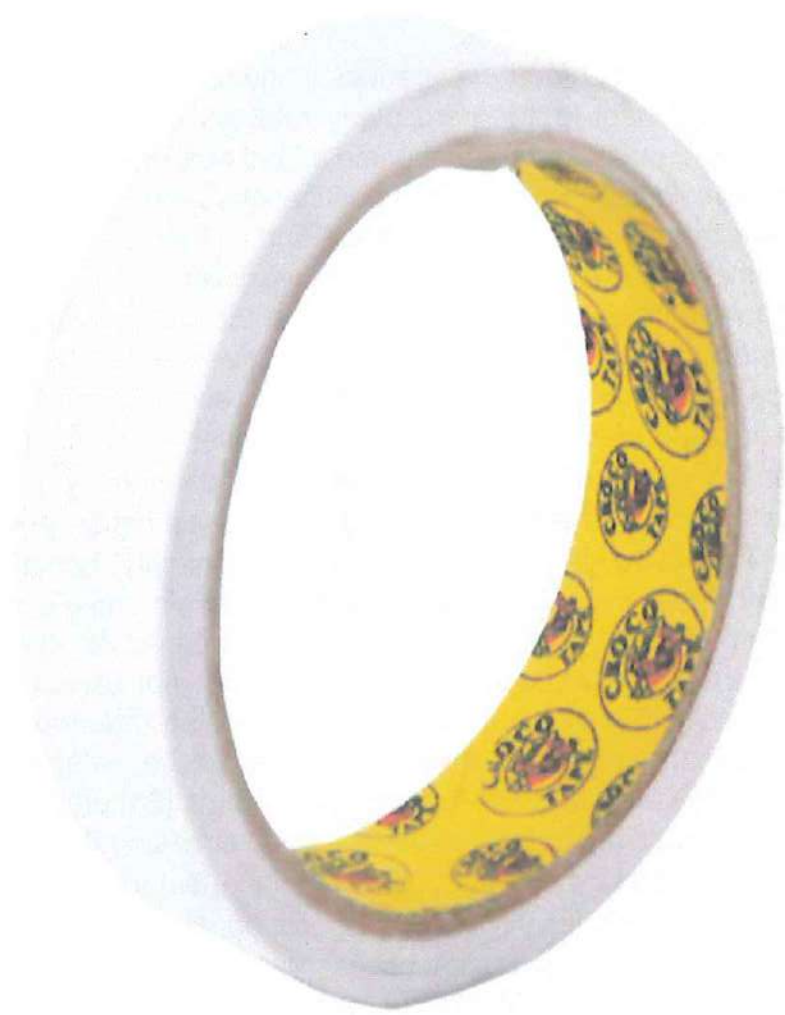
CROCODILE DOUBLE SIDED TAPE - 1 INCHES