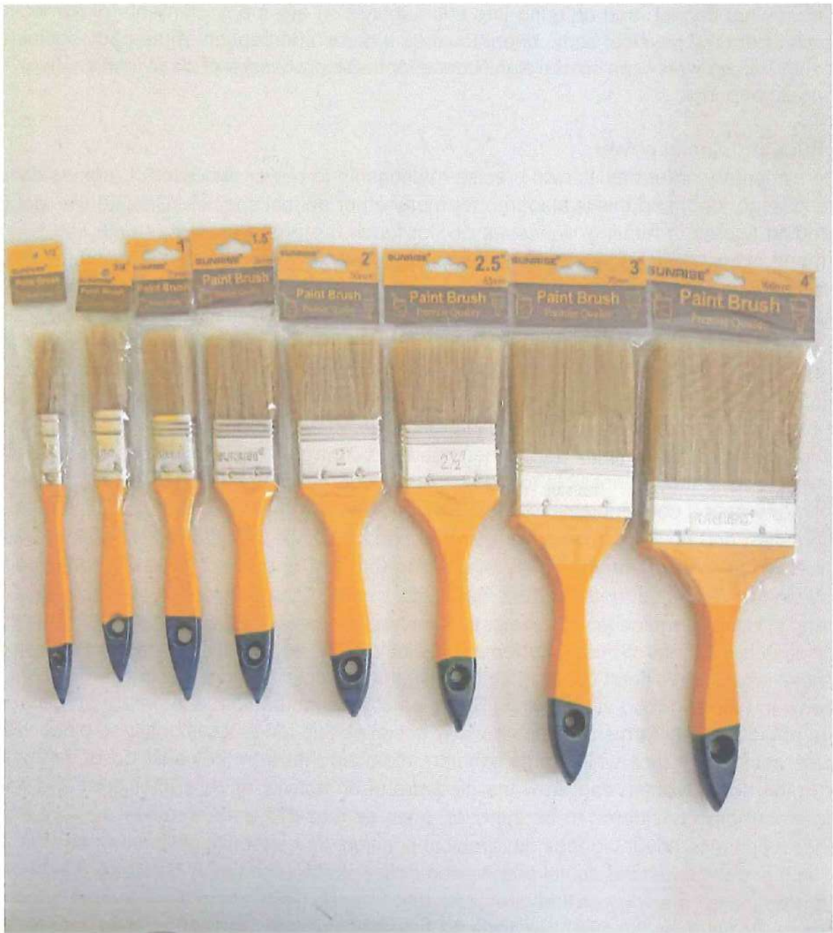
PAINT BRUSH - 1 INCHES 1 2 INCHES